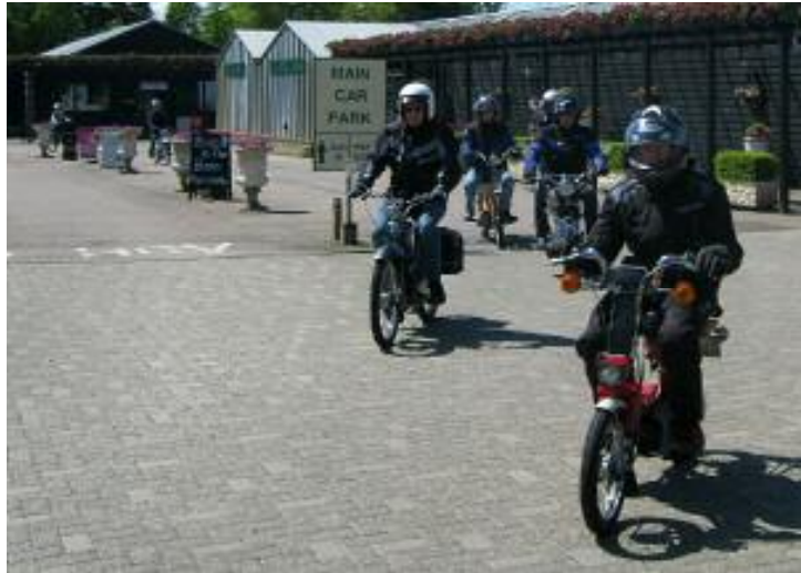
Setting off on the Reservoir Dogs Run