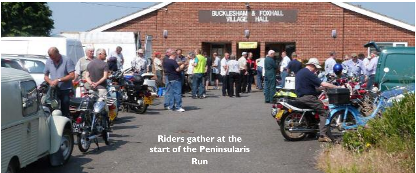
Riders gather at the start of the Peninsularis Run